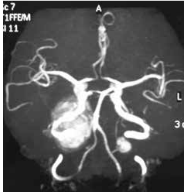
Figure 3: MRA showing no evidence of intracranial aneurysm

diagnosis of Anton syndrome where the patient denies blindness. In our case, the patient did not tell his relative about his loss of vision but explained that he can see although it is blurred.