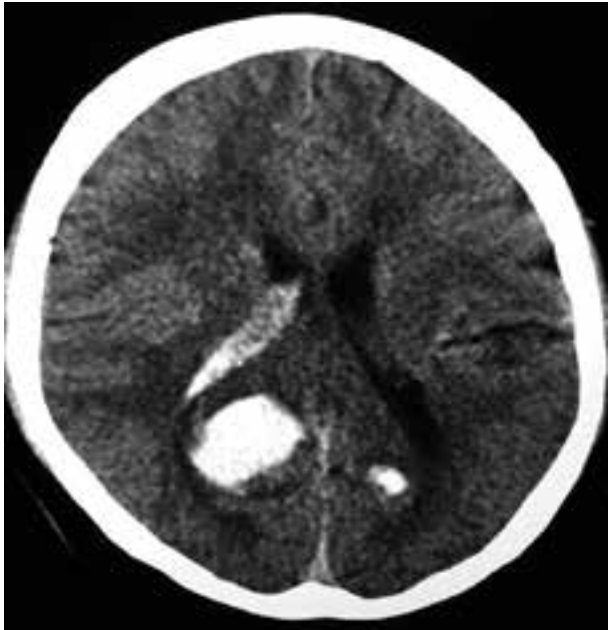
Figure 1. CT Brain showed bilateral occipital fresh intracerebral haematoma

and phenytoin. After neuro-surgical opinion, it was decided to manage him conservatively. On day two his headache had reduced and vision improved slightly with perception of lights and abnormal finger counting.